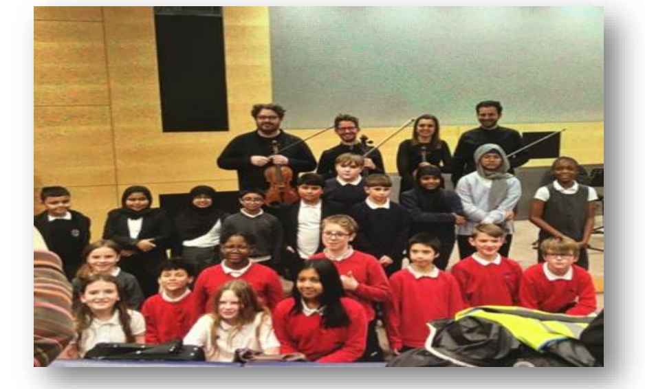
The children were treated to Joseph Haydn String Quartet in C minor , Op.17 No 4 Shostakovich String Quarter No 7 in F sharp minor, op 108