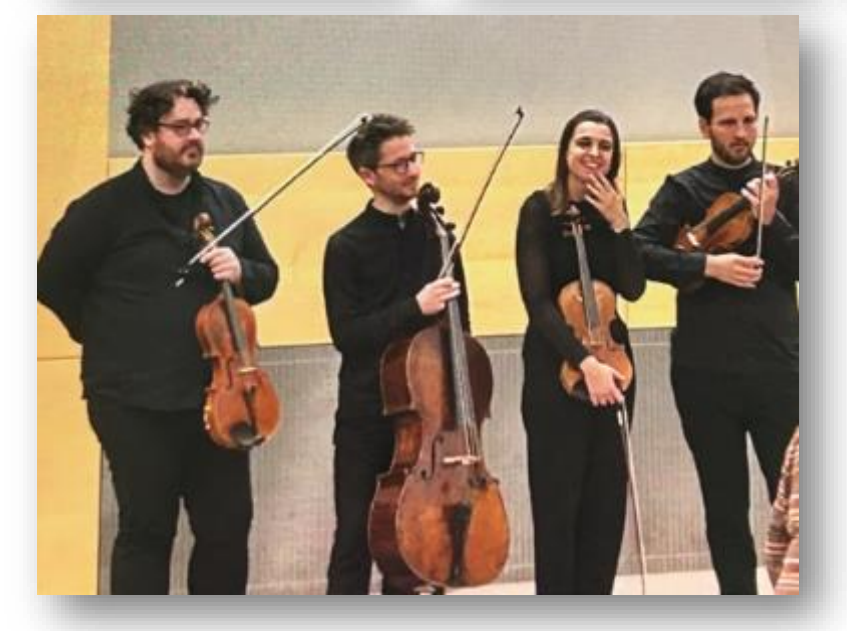
The Musicians were the Adelphi Quartet supported by the Young Classical Artists Trust and Clifford Chance.