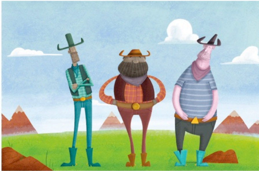
A group of cowboys

Cowboys were needed to move the cattle from one place to another. This could take months, so the cowboys lived and worked together and became friends.