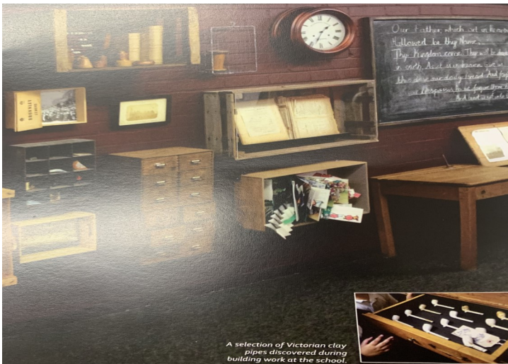
A selection of Victorian clay pipes discovered during building work at the school.