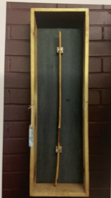
The cane: a well used St. Saviour's School behaviour strategy during the late 19th and early 20th century (not in use today!).