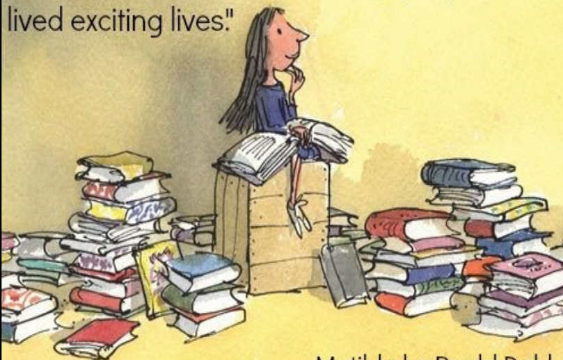
Matilda by Roald Dahl

"The books transported her into new worlds and introduced her to amazing people who lived exciting lives!"