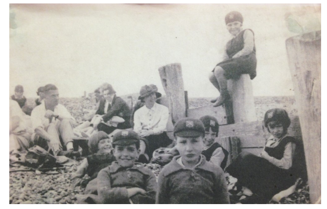
A group of St. Saviour's School pupils at the seaside during Old Tree Camp, 1938.

St. Saviour's School continued its good work within the community after Father Dolling's death. The school found much favour with school inspectors during the first forty years of the 20th century with numerous positive comments.